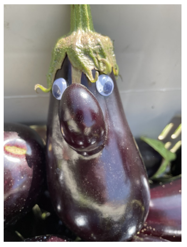
Ten members of the Great Lakes Chapter of the Appraisal Institute volunteered at the Forgotten Harvest Farm in Fenton to help get fresh produce to those in need. Forgotten Harvest provides families in need with fresh and nutritious food free of charge with the goal of relieving hunger in metro Detroit by rescuing and redistributing surplus food.