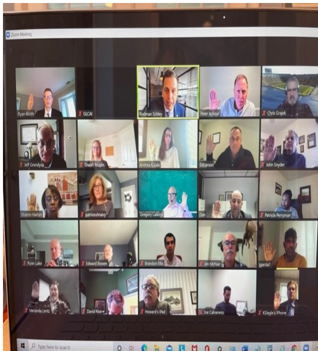
Swearing in of our 2021 Chapter Officers.