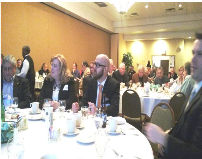
Everyone enjoying their dinner.