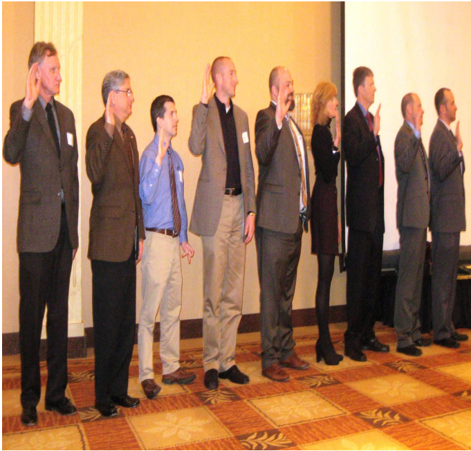
Swearing in of the 2014 Great Lakes Chapter Board of Directors.