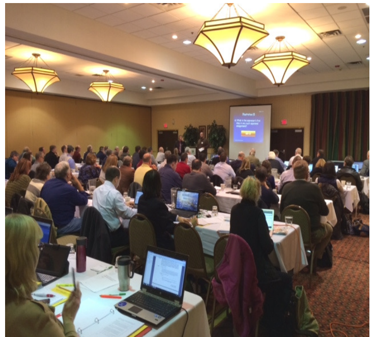
A very full class of 94 students.