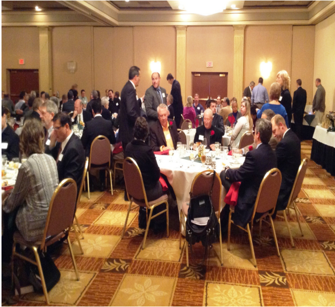
We had 106 in attendance for the December Chapter Meeting.