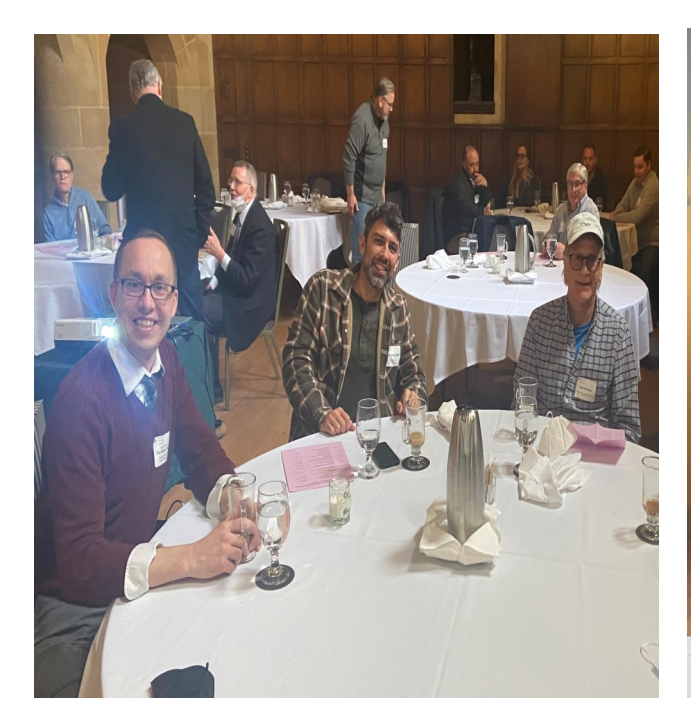
2022 Winter Economic Summit and Chapter Meeting