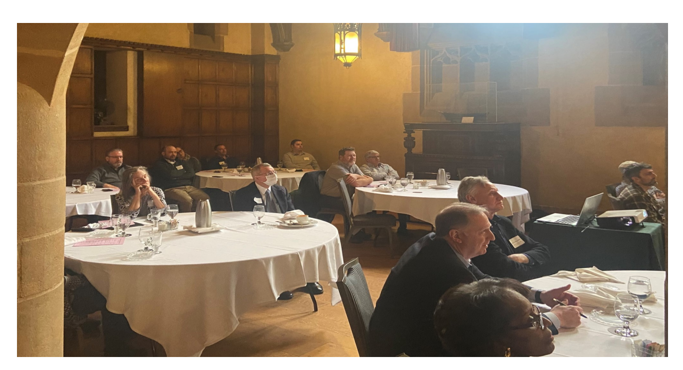
Everyone listening intently!!