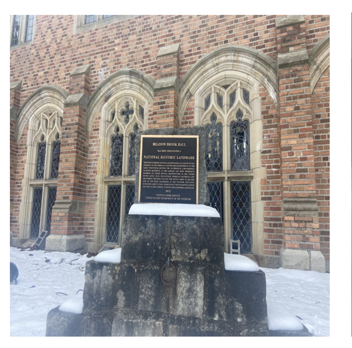
2022 Winter Economic Summit & Chapter Meeting