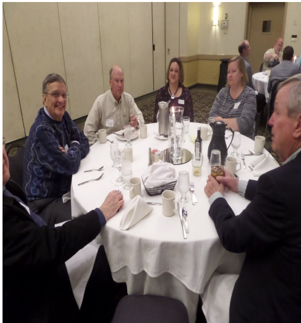
Everyone waiting patiently for Dinner.