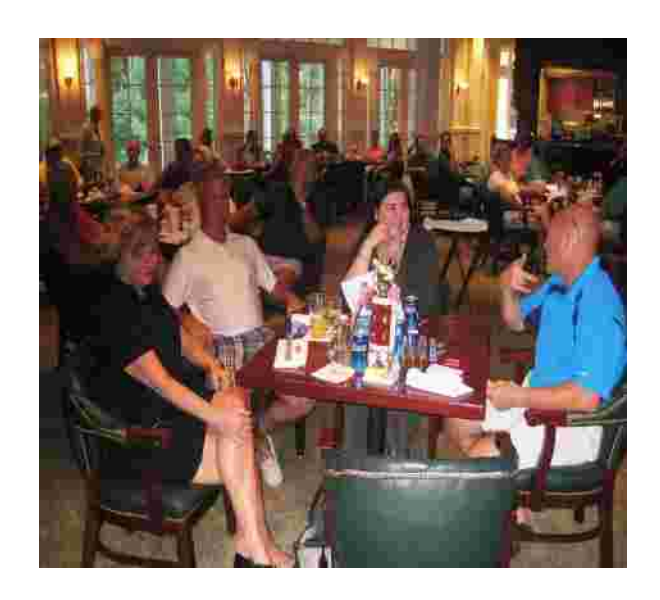
Relaxing and enjoying the dinner after a long day of golf.