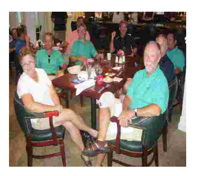
Waiting for the program to begin.