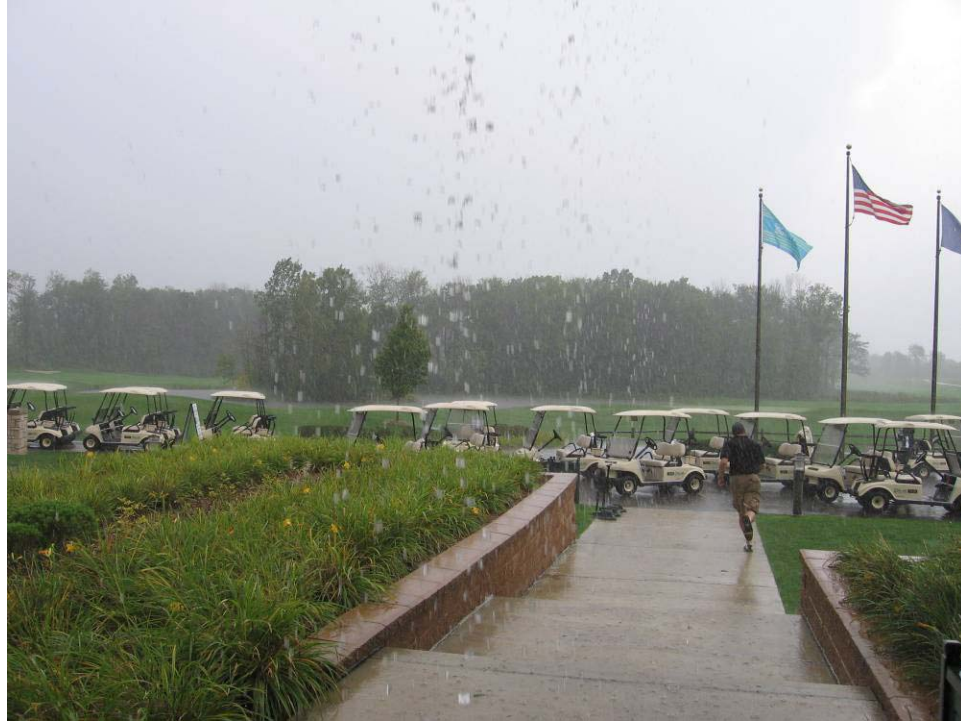
Unfortunately the weather was not corporative.