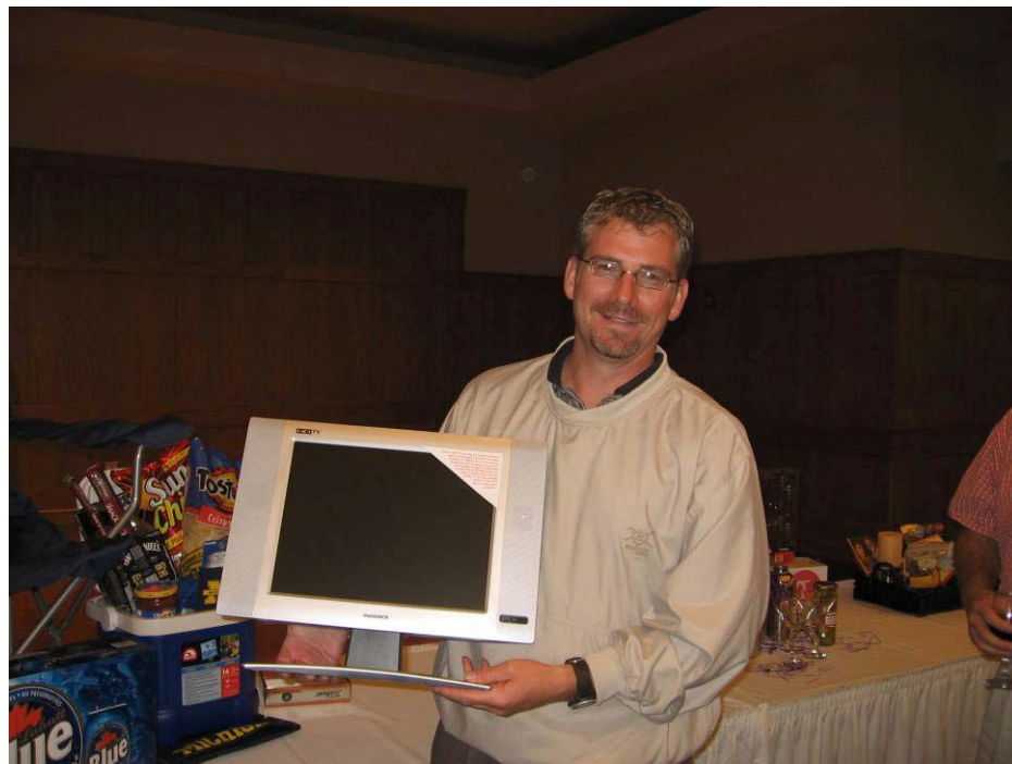
The grand prize winner showing off his new flat panel monitor