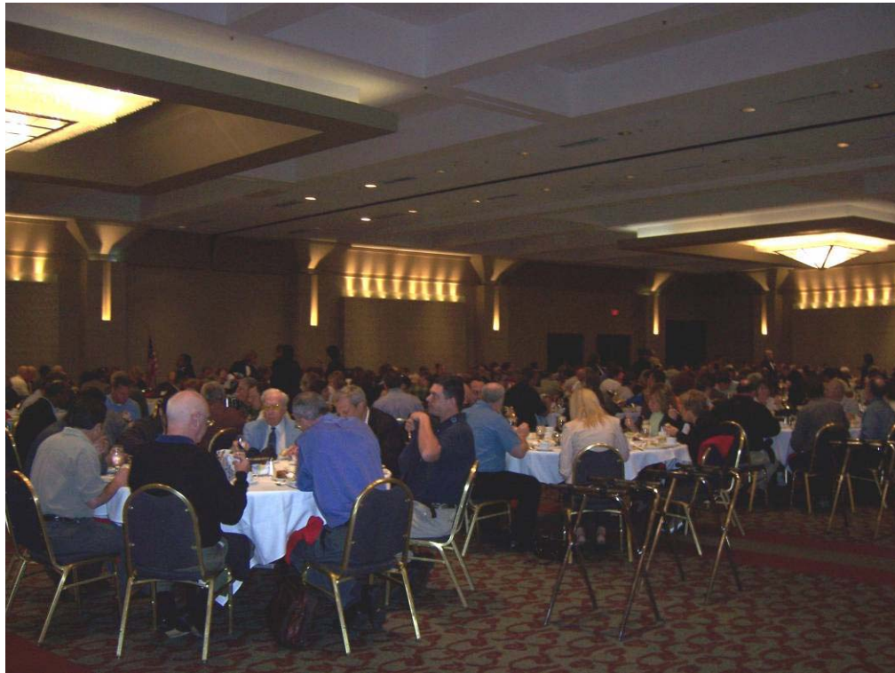
Lunch time at the Seminar.