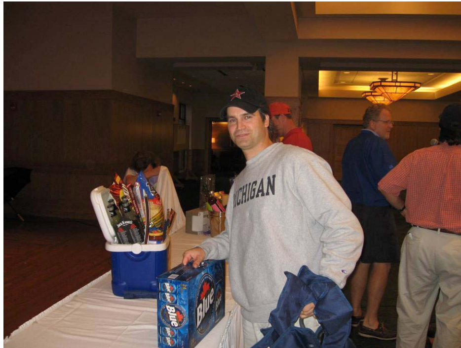
A couple of prizes that won't go to waste.