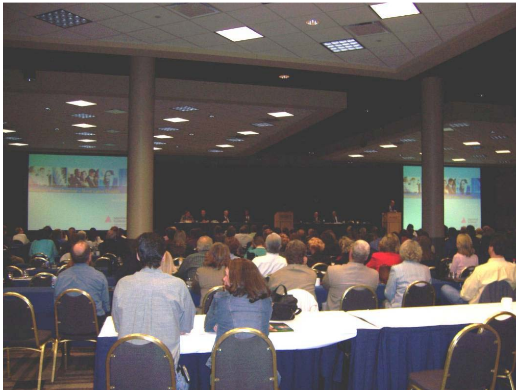
Looking on from the back of the Seminar