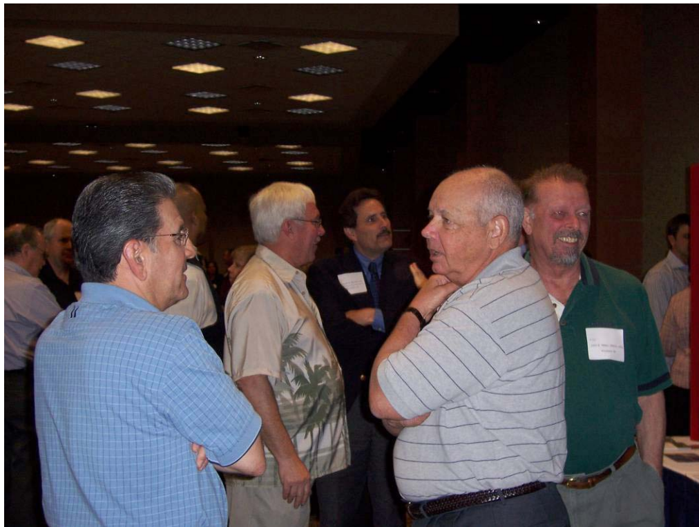
Great Lakes Chapter members discussing the seminar.