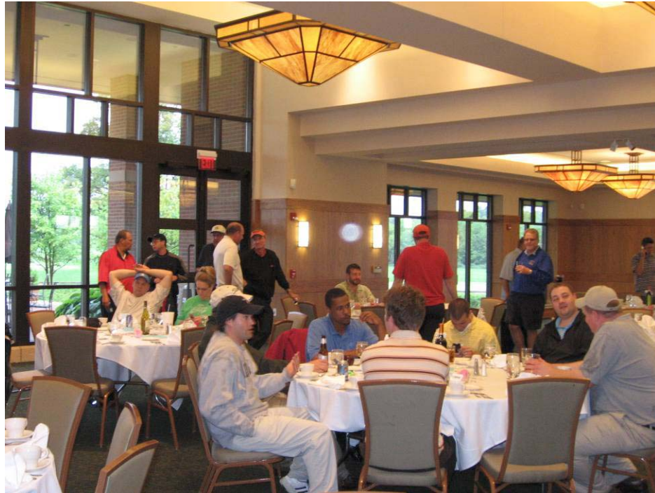
Enjoying the Banquet after the Golf Outing.