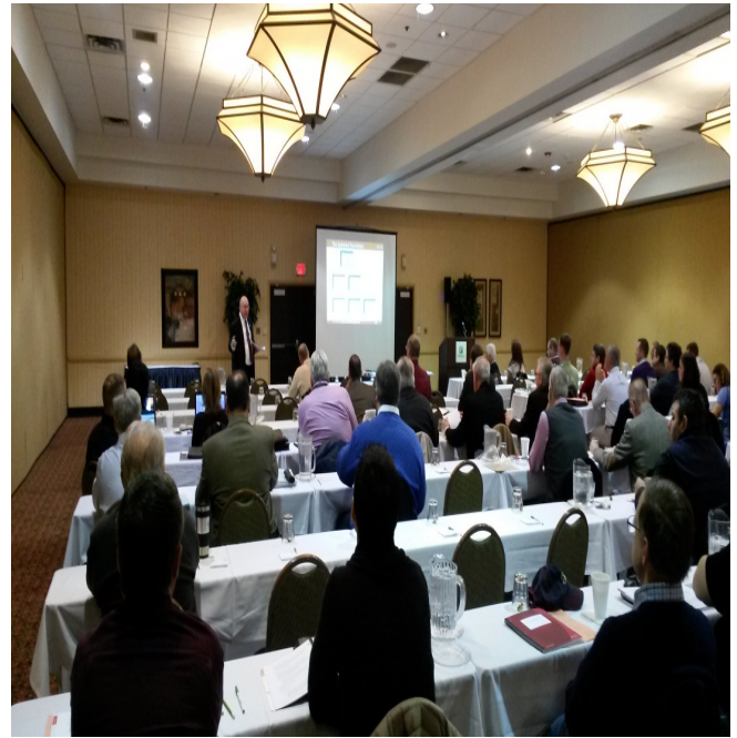
A good turnout for the new seminar “Supervisory Appraiser/Trainee Appraiser Course.”