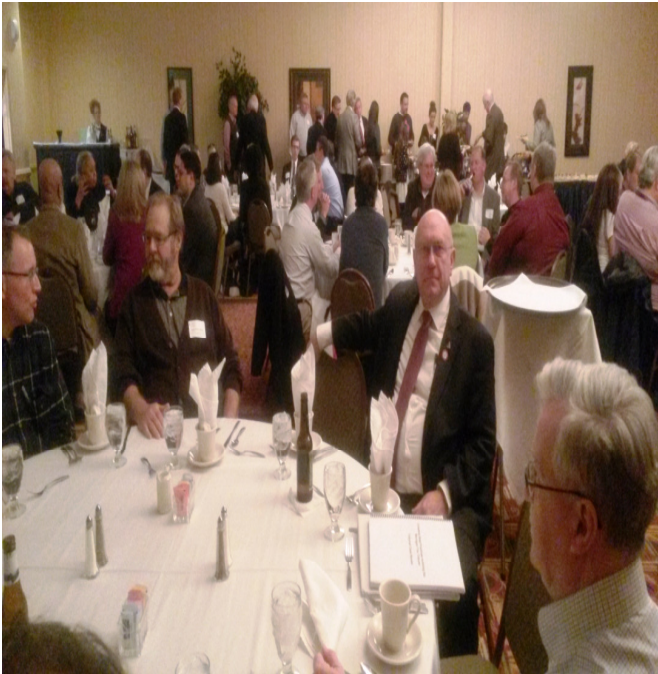
Waiting for dinner to be served.