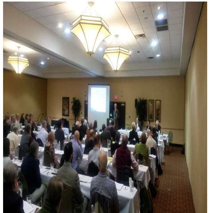
Also, a nice turnout for the p.m., Chapter Developed Seminar “Creating Best Practices Involving the Michigan Tax Tribunal.”