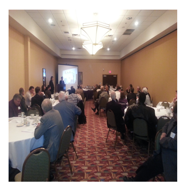
2 hours of continuing education "Hot Topics and