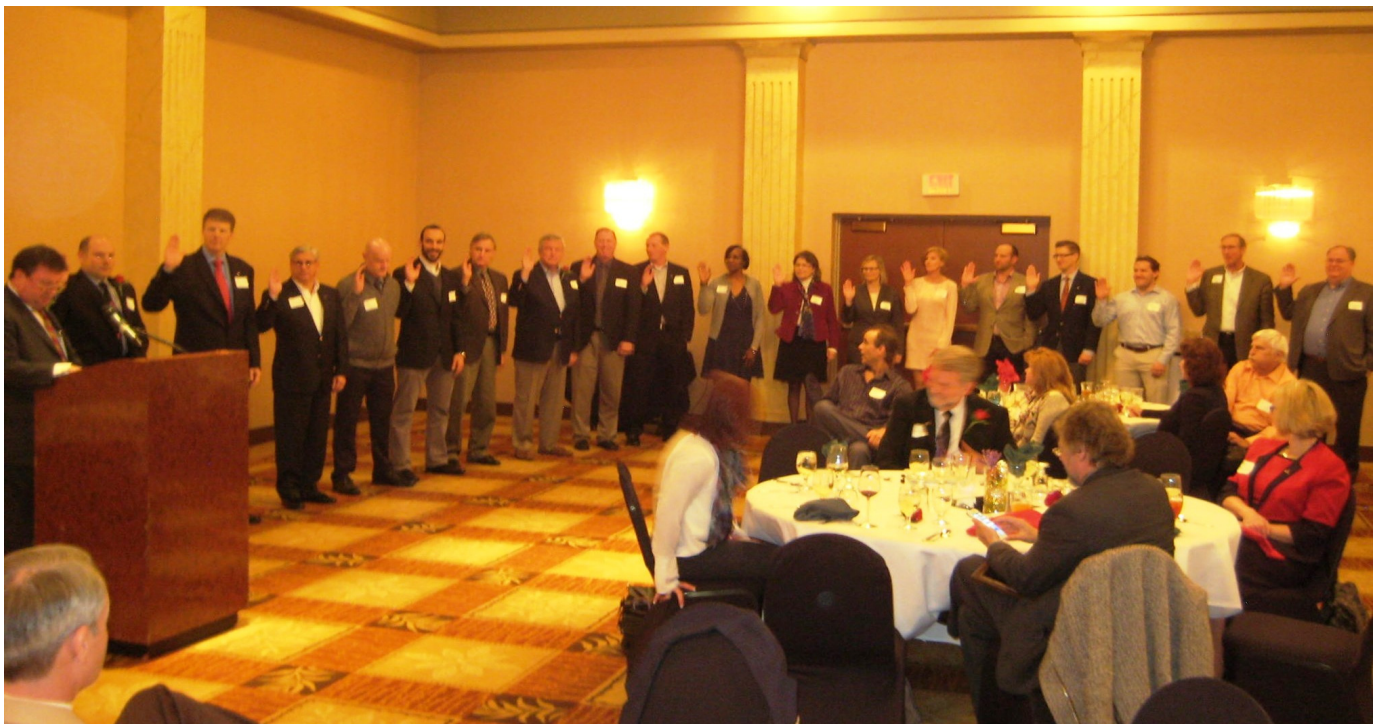
Swearing in of our 2016 Chapter Officers.