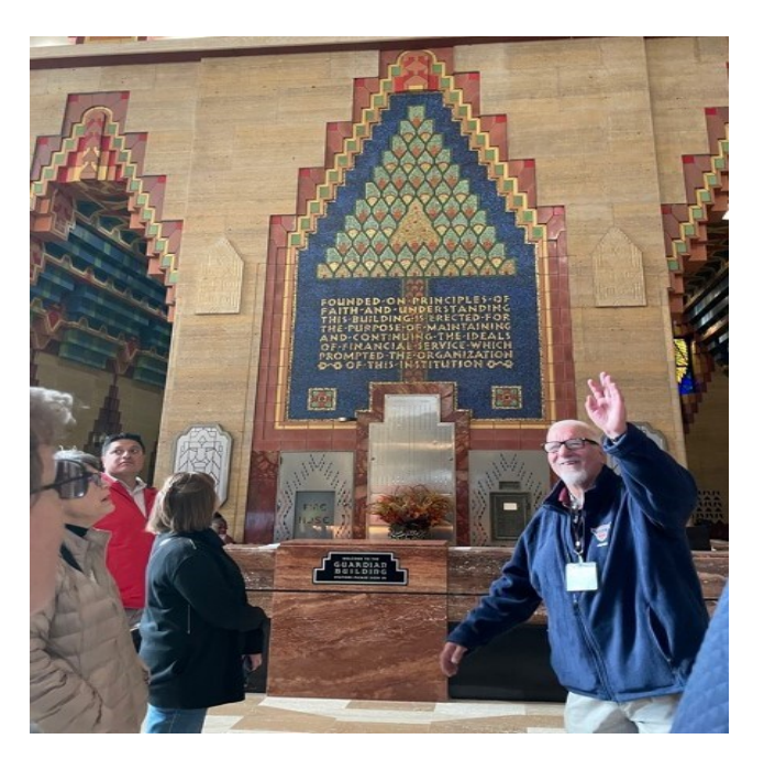
One of our great tour guides from the Preservation Detroit.