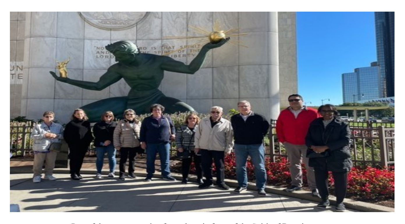
Part of the group stopping for a photo in front of the Spirit of Detroit.