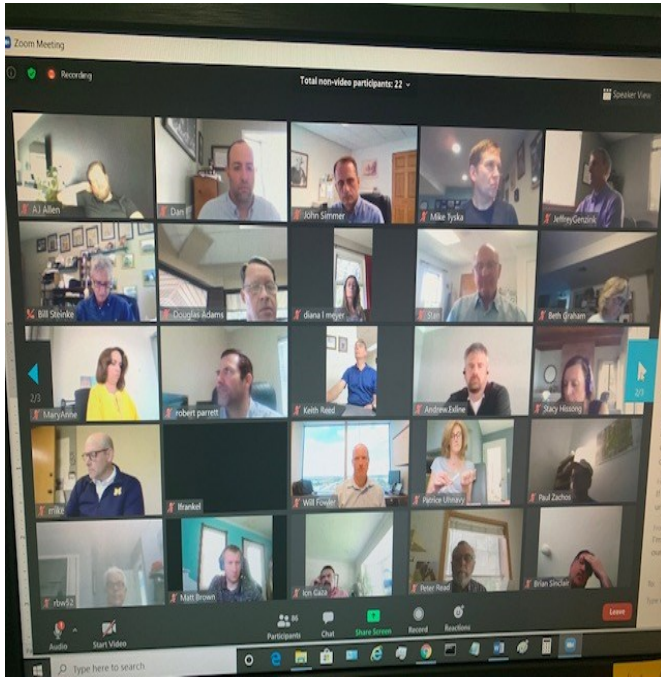
We had 63 in attendance to our November Virtual Economic Summit.