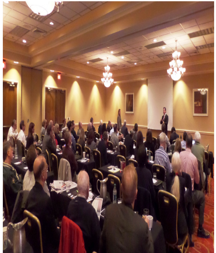
A very nice turn out for our 2014 Economic Summit.